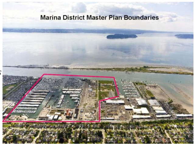
Marina District Master Plan Boundaries